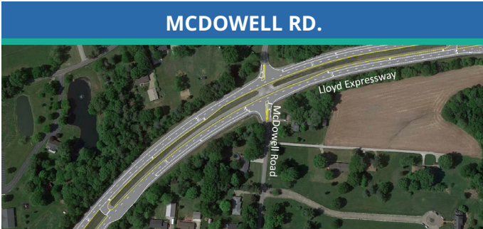
Reduced Conflict Intersection