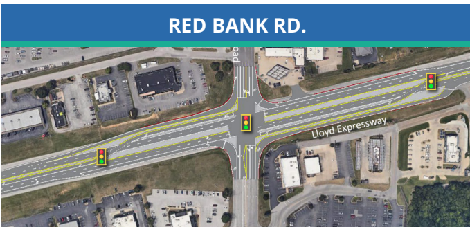
Dual Displaced Left Turns