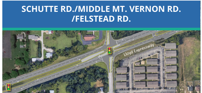
Restricted Crossing U-Turn